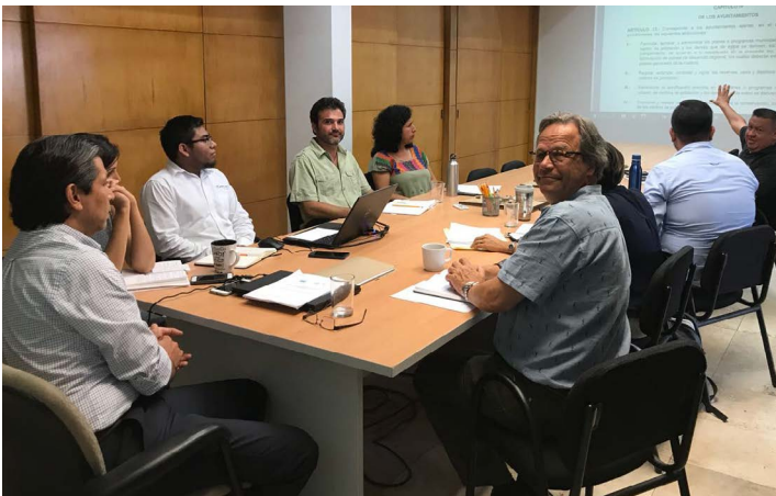
Cabo Pulmo Vivo Coalition meeting with local planning authorities